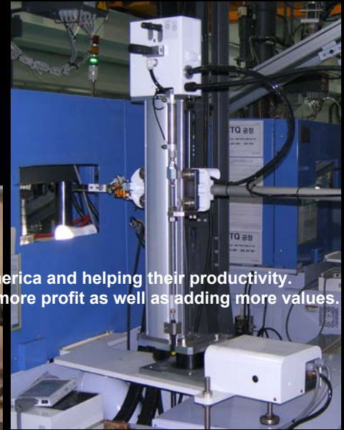
TOPIV-Vertical installation on JSW

Famous TOPIV Swing Robots installed more than couple hundreds molders in North America and helping their productivity. Existing customers keep adding more TOPIV on their molding machine in order to pick more profit as well as adding more values.