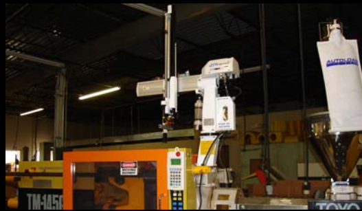
2 TOPIV installed in Forte in KS