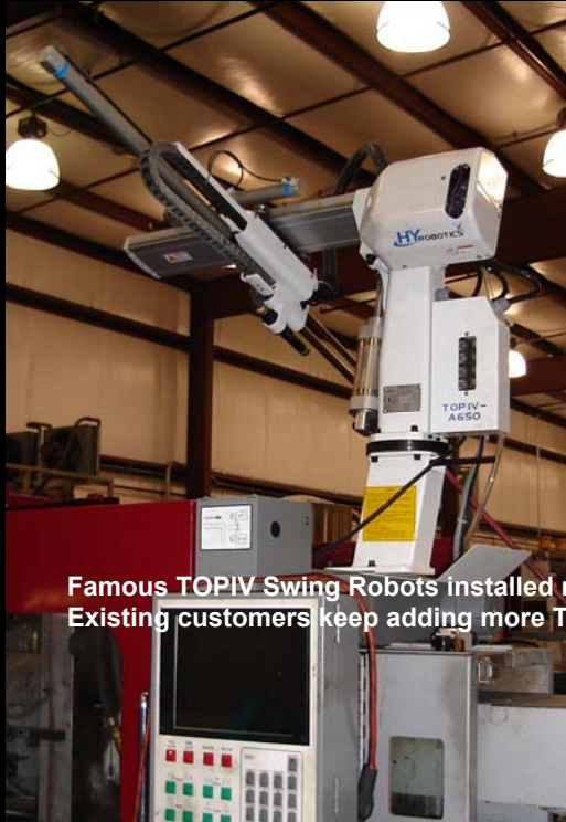
6 TOPIV installed in Enterprise Plastics in OH

HYROBOTICS CORP 5988 Mid Rivers Mall Dr. St.Louis MO 63304 Tel : 1-636-578-6059 Fax : 1-866-232-5594 WWW.HYROBOTS.COM