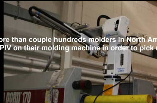
7 TOPIV installed in Westmed in AZ